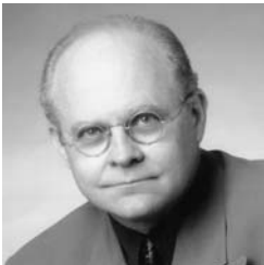
Price to sign books