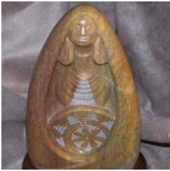
Sculptures on display